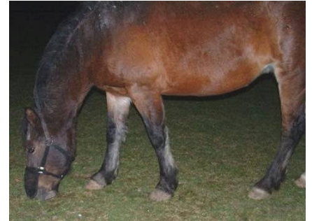
Jane uses the AW over night when midges are at their worst

Torrential downpours and heavy dews cause no problem for AW use. Now that I can provide consistent daily EB