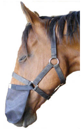
Another added bonus is fly protection for the muzzle

In cases where the maximum Equine Breathing effect is required, the All Weather Breather use can be supplemented by designated, and more intense