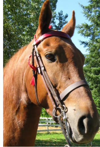
September – nostrils still have a way to go...

Do get in touch if you have any queries Till next time breathe easy Clare