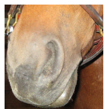
Nostrils near the start in July - thickened and enlarged

I found the Equine Breathing website in June and it sounded good but I had been so disappointed to date. I was feeling so desperate for my horse and my self and not knowing where to turn. My horse was so bad I had no time to wait to try Equine Breathing as I was considering putting him down. I had no fears or concerns about trying it, just went ahead and started. After one week the 1N had already made a difference in this horse.