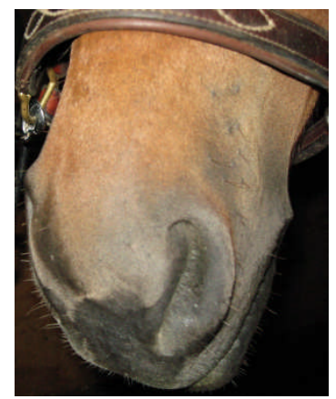
Some improvement by August