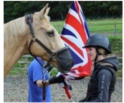
Kite is now able to enjoy activities such as Agility

Chico is much calmer now, and doesn't boss the others around so much.