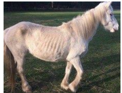
Before Equine Breathing

Bella lost a lot of weight after my injury and it was a big struggle for her to re-gain it. The difference in her since using the All Weather Breather is incredible!